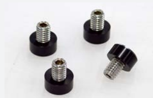
StandOff caps and cup-point screws